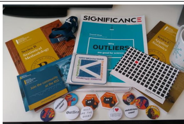
Most important part of any conference, the freebies!

After three, highly informative days I was soon on my way back to sunny Sussex. Head weighed down by a mixture of newly obtained statistical knowledge,